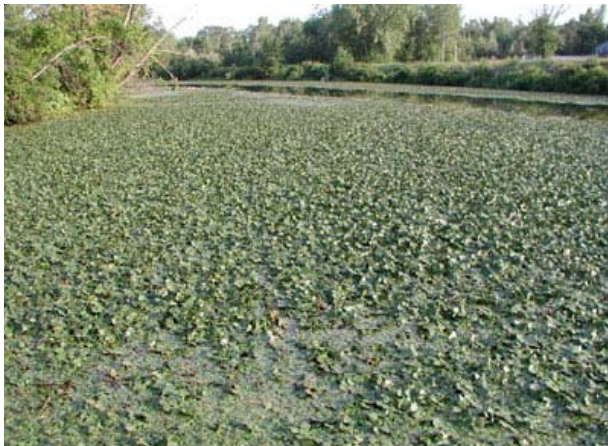
5. A major river infestation (Mehrhoff, IPANE)

Another effect of dense populations of water chestnut, related to the reduction in dissolved oxygen under the plant, is the migration of small fish from under the canopy to the edges of the vegetative mat. The resulting concentration of small fish can result in a concentration of larger game fish attracted to the veritable “smorgasbord” at the fringe. This can also result in recreational anglers being drawn to the concentration game fish.