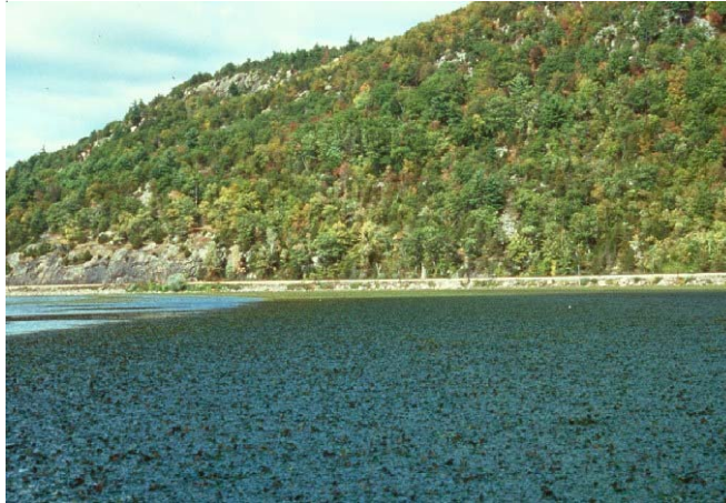
4. Water chestnut infestation on Lake Champlain

Water chestnut has become a significant nuisance throughout much of its range, particularly in the Hudson, Connecticut and Potomac Rivers, and in Lake Champlain. The plant can form nearly impenetrable floating mats of vegetation. These mats create a hazard for boaters and other water recreators. The density of the mats can severely limit light penetration into the water and reduce or eliminate the growth of native aquatic plants beneath the canopy. The reduced plant growth combined with the decomposition of the water chestnut plants which die back each year can result in reduced levels of dissolved oxygen in the water, impact other aquatic organisms, and potentially lead to fish kills. Trapa's rapid and abundant growth can also out-compete native aquatic vegetation.