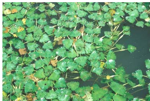
1. Trapa rosettes on water surface (TNC)

The water chestnut is native to Europe, Asia and Africa. In its native habitat, the plant is kept in check by native insect parasites. These insects are not present in North America and the plant, once released into the wild, is free to reproduce rapidly. Trapa colonizes shallow (less than 16 feet deep) areas of freshwater lakes and ponds, and slow-moving streams and rivers, where it forms dense mats of floating vegetation. Water chestnut favors nutrient-rich waters with a pH range of 6.7 to 8.2 and an alkalinity of 12 to 128 mg/l of calcium carbonate.