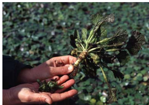
2. Trapa rosette showing nuts and inflated leaf petioles (USACE)

It should be pointed out that this plant species is not the same as the "water chestnut" (a tuber from a different plant) which can be purchased in cans at the supermarket and which is used in Asian cooking. The fruits of Trapa natans , however, are used as a source of food in Asia and have been utilized for their medicinal (and claimed) magical properties.